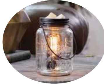
Mason Jar Edison Melter