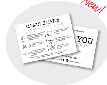
Candle Care Card 25 Pack (5x3.5 inches)