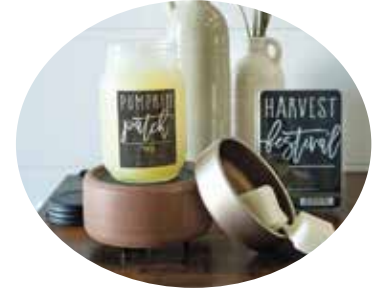
Pewter Walnut 2-in-1 Melter