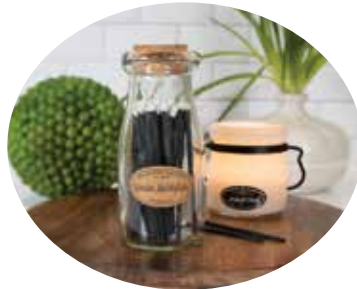
Matchsticks in Milkbottle 4 Pack (Roughly 80 matches per bottle)