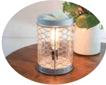
Chicken Wire Vintage Melter