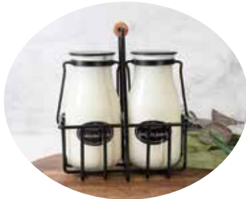
2 Cell Metal Milkbottle Holder