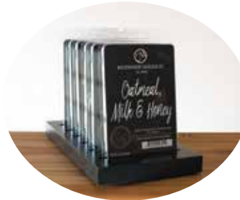
Display Wooden Holder holds 6 Melts - 6 Pack (5x9x.75 inches)