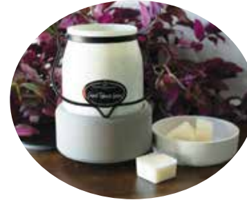
Gray Texture 2-in-1 Melter