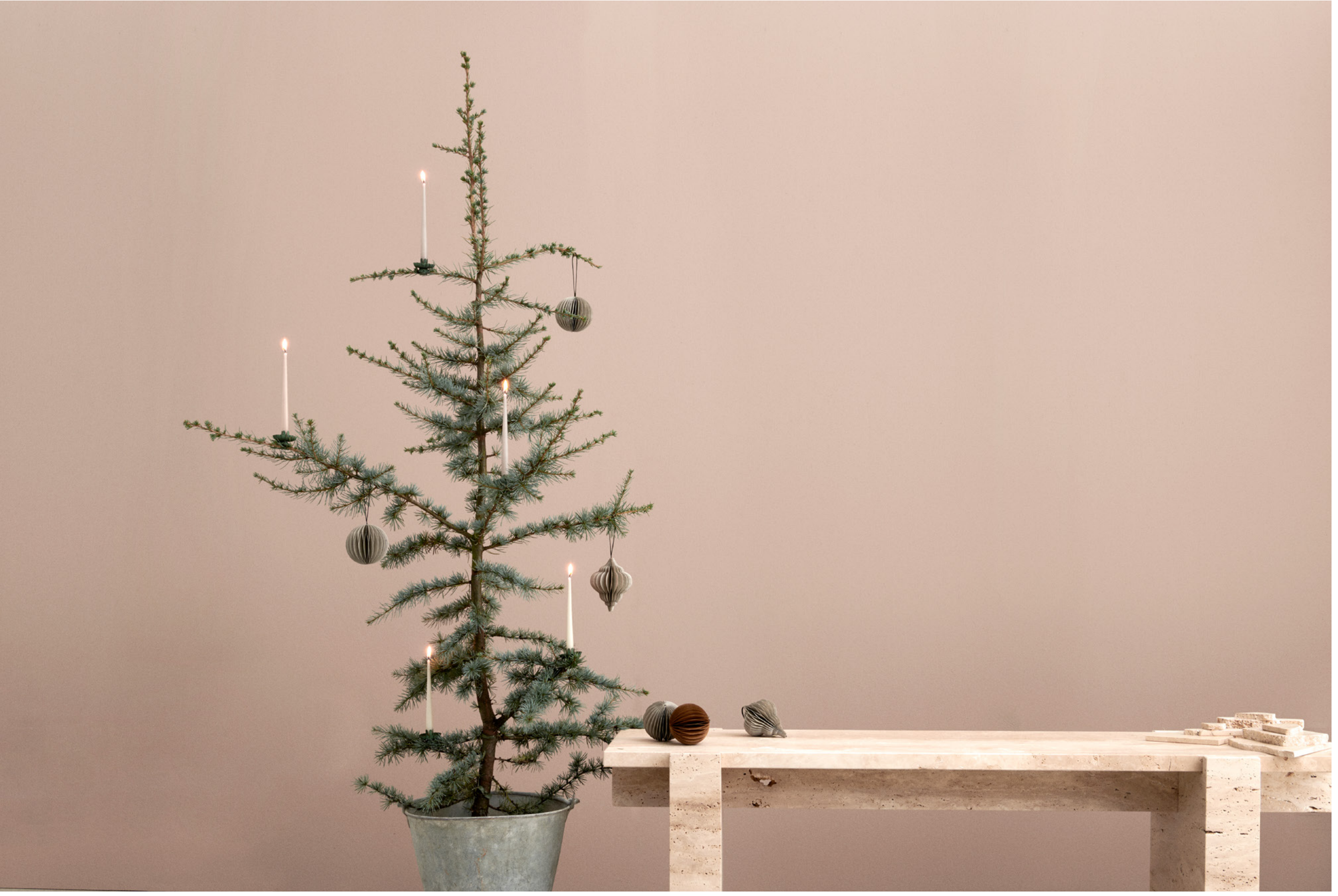
CANDLE COLOURS NO. 22, 11, 06