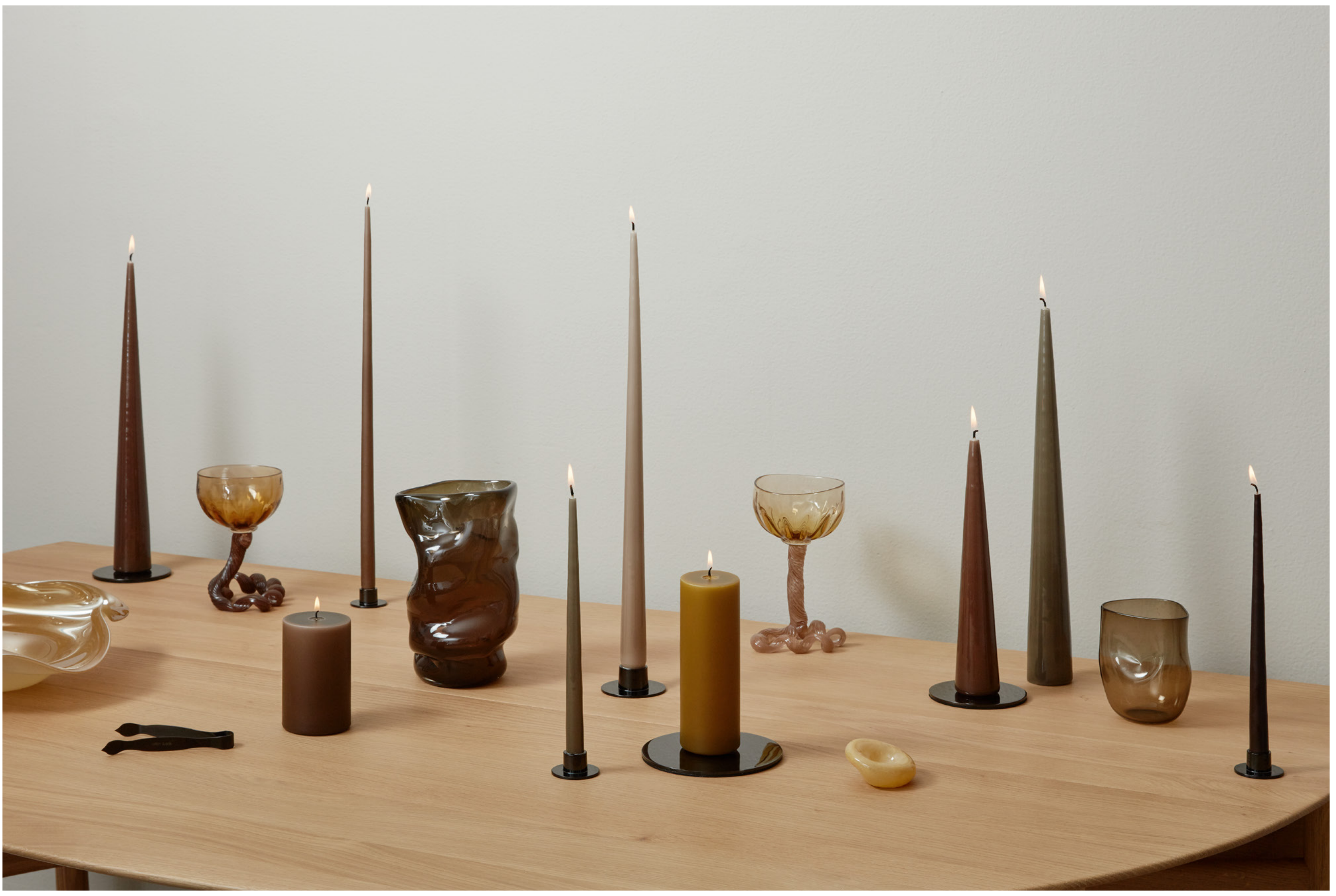
CANDLE COLOURS NO. 25, 25, 25, 77, 18, 73, 25, 77, 79