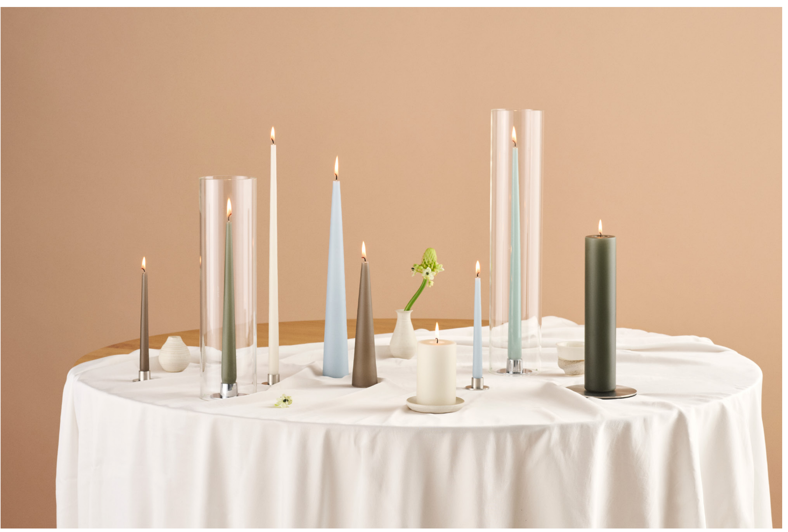
CANDLE COLOURS NO. 77, 70, 06, 83, 77, 06, 83, 67, 70