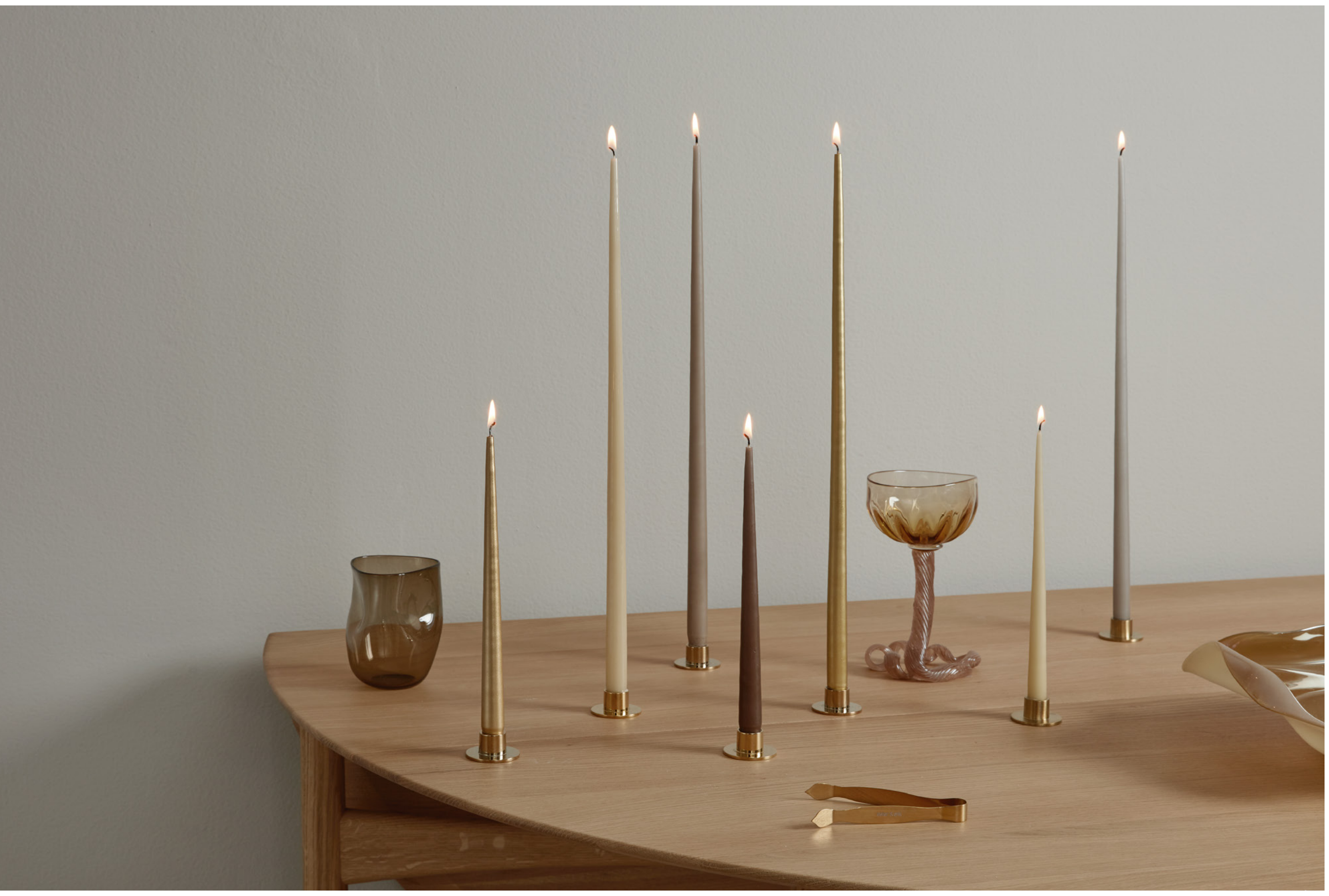
CANDLE COLOURS NO. 90, 14, 18, 25, 90, 14, 22