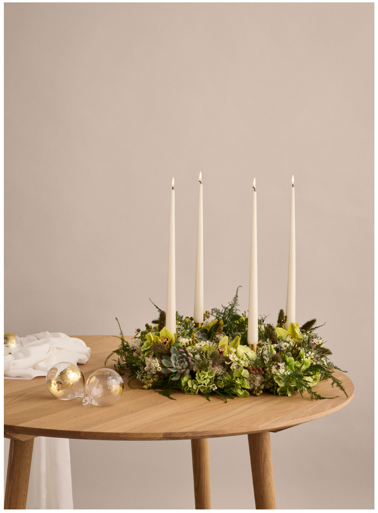
CANDLE COLOUR NO. 06