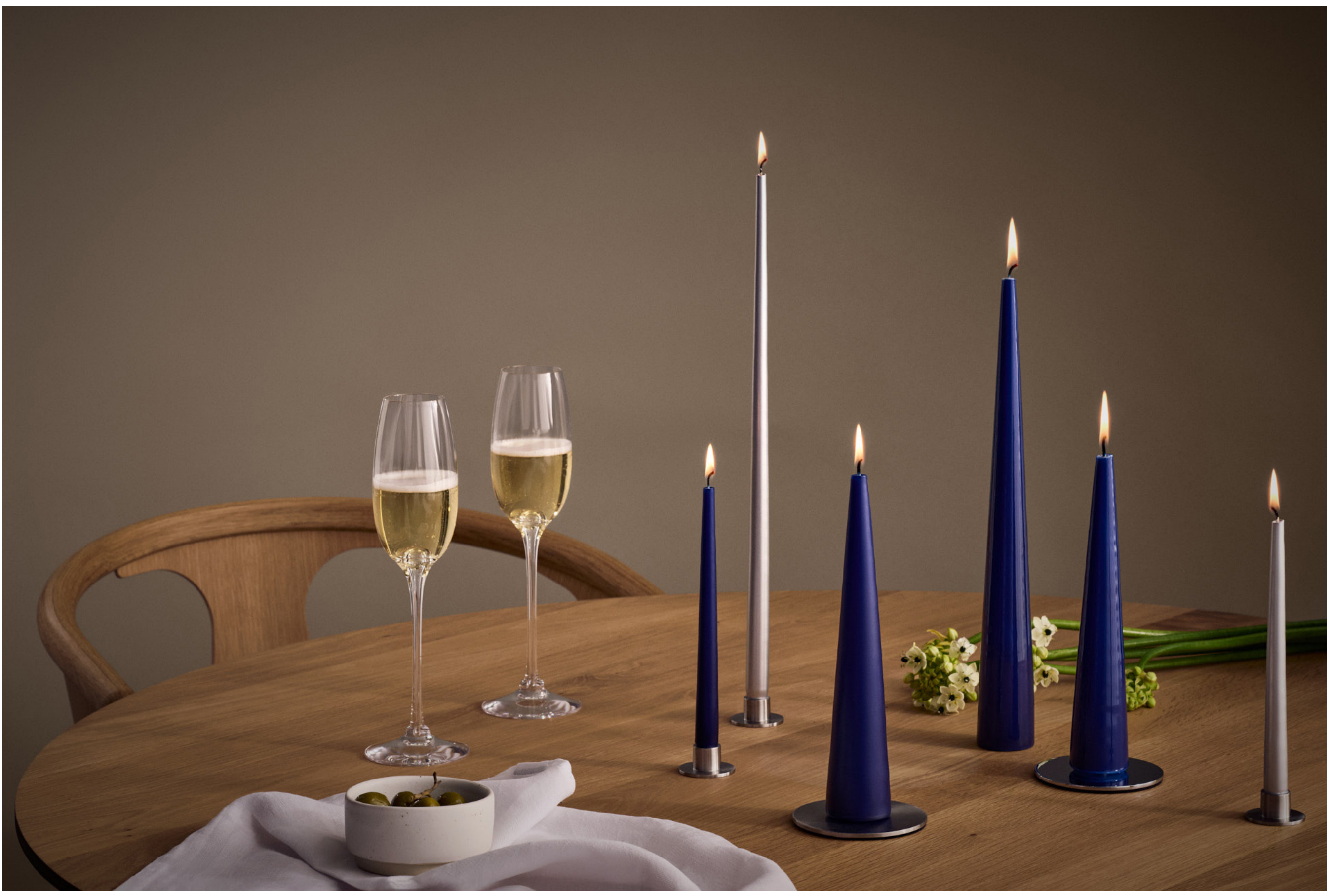
CANDLE COLOURS NO. 28, 92, 28, 28, 28, 92