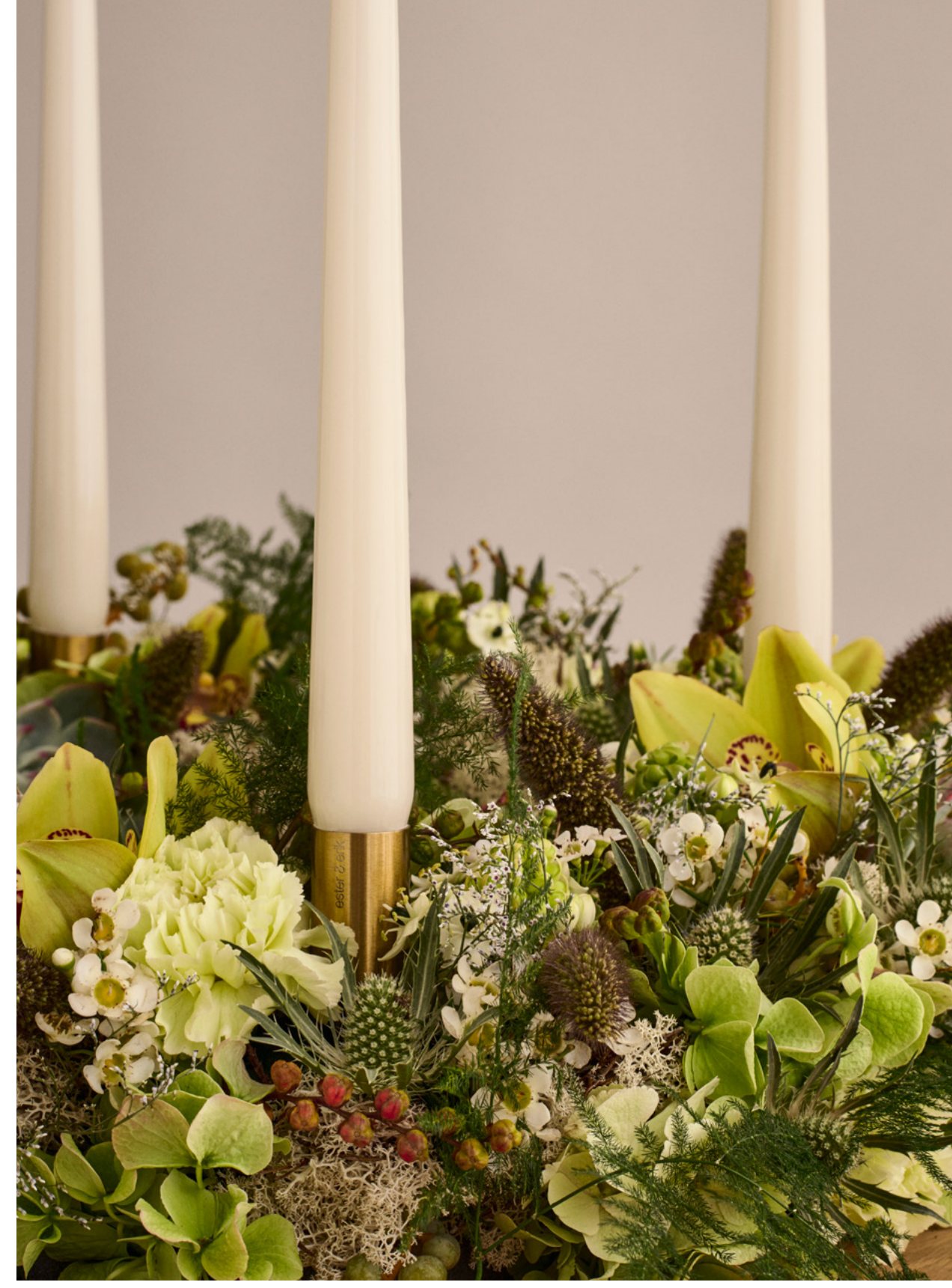
CANDLE COLOUR NO. 06